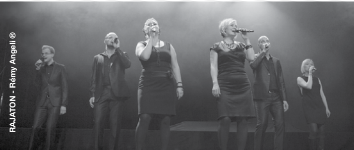
RAJATON - Rémy Angeli ©